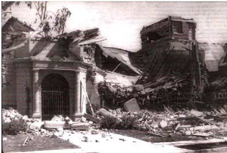
Jefferson High School after the 1933 Long Beach Earthquake.

Thus that 1933 Long Beach earthquake remains pivotal and historic. On March 10, 1933, a moderately strong earthquake struck just off the southern coast of Los Angeles County. It had the same intensity as a 1925 Santa Barbara earthquake, but occurred in a more densely populated region and produced considerably more damage. The quake caused 115 deaths and property estimated at $60 million, over $1.5 billion in today's dollars, primarily in Long Beach and adjoining suburbs of south Los Angeles. Fortunately schools were not in session when the temblor hit, but school buildings suffered a disproportionate amount of damage. All schools in Los Angeles were closed for one week to allow for structural inspections. Seventy schools were destroyed and 120 suffered major damage. In addition, 41 schools were deemed unsafe for occupancy and remained closed.