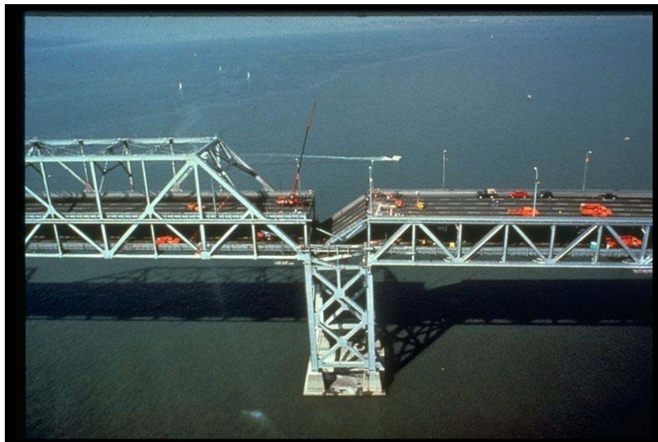
Collapse of the upper deck of the San Francisco Bay Bridge during the Loma Prieta earthquake in October 1989.