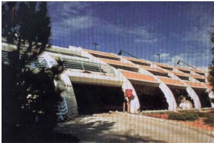
The California State University Northridge parking structure was built in the early 1990s and collapsed in the Northridge earthquake.