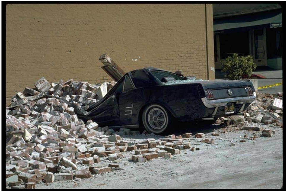
Car crushed by falling brick in the 1987 Whittier earthquake.

In May 1983, the Coalinga earthquake struck in southern Fresno County and caused at least $31 million in damage. Nearly 200 people were injured and approximately 1,000 left homeless. Production in the surrounding oil fields was disrupted and downtown businesses were forced to relocate or close as a result of earthquake damage. Coalinga was faced with rebuilding or repairing virtually the entire 12-square block downtown business district and replacing or repairing two-thirds of its housing.