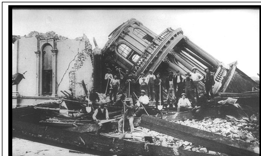
Santa Rosa City Hall in the aftermath of the great earthquake of 1906.