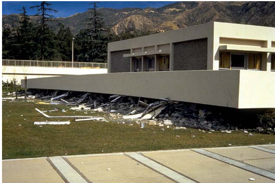
Collapse of the Psychiatric Ward of the Olive View Hospital in 1971.

In January 1972, Governor Ronald Reagan established the Governor's Earthquake Council as the administration's reaction to the San Fernando Valley earthquake and to the work of the Legislature's Joint Committee on Seismic Safety. The council continued in existence until the Seismic Safety Commission was up and running in 1975.