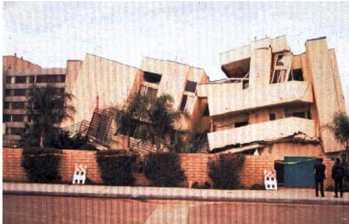
Apartment buildings with soft stories that partially collapsed after the 1994 Northridge earthquake.

At 4:31 on the morning of January 17, 1994, a magnitude 6.7 earthquake with an epicenter near Northridge rocked the San Fernando Valley and neighboring regions. The earthquake hit very early on a national holiday when most residents were home asleep. Fifty-seven people lost their lives, nearly 9,000 were injured, and damage exceeded $20 billion. The Northridge earthquake