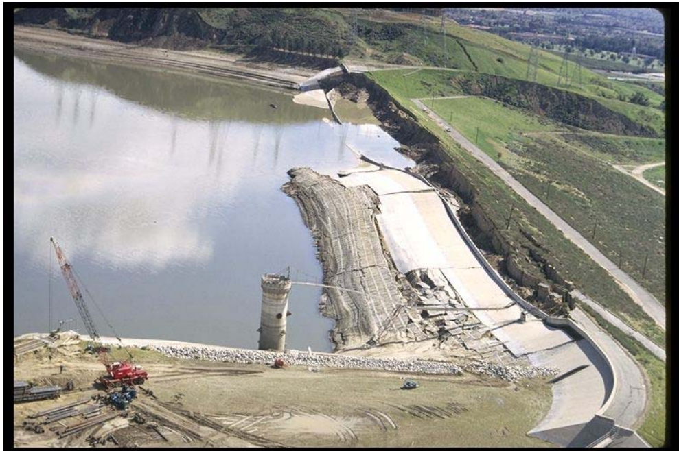
The upstream face and crest of the Lower San Fernando Dam slid into the Lower Van Norman Reservoir in 1971, prompting the evacuation of 75,000-80,000 residents downstream.

In 1982 and 1983, the commission held hearings on dam safety. Projects that were sponsored by local governments or agencies but designed and built by federal authorities were considered federal projects and did not undergo state or independent review. As with the Auburn and Warm Springs dams, the commission sought to bring independent review to all such critical projects. Finally, in 1993, the Army Corp of Engineers agreed to permit personnel from the state's Safety of Dams Division to review the safety of federal dam projects.