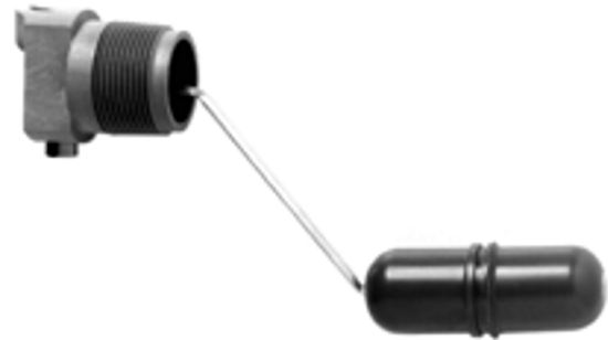
Figure 1: F93B Air Volume Control for Deep Wells

The F93H has a minimum pressure release valve to avoid lowering tank pressure below 25 psig (172 kPa). Use this model on applications where water may be rapidly drained.