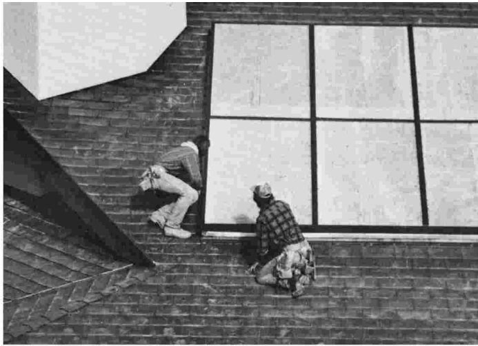
"New copper shingles can be installed easier than almost any other roofing method. Just snap two copper shingles together, and then put in two copper nails. No highly skilled craftsmen are needed," says the principal architect of this Denver home and member of the legendary Wright Foundation.

So sure is the architect that the passive cooling system will work that the house has no mechanical air cooling system. The home's passive heating system is assisted by a natural gas system.